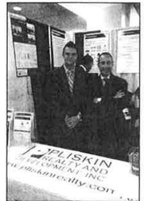
International Council of Shopping Centers trade show booth

will listen to your needs and present properties and locations that meet your requirements. The New York market is one of the best in the world and we're not just talking about Manhattan. The boroughs and Long Island are among the nation's most attractive regions from a household income and discretionary spending standpoint.